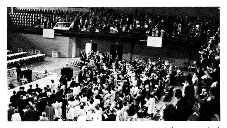
2,300 gather in the huge Hammond Civic Auditorium which has the capacity of seating 5,000. The remaining part of the auditorium was to provide ample space for the noon meal.