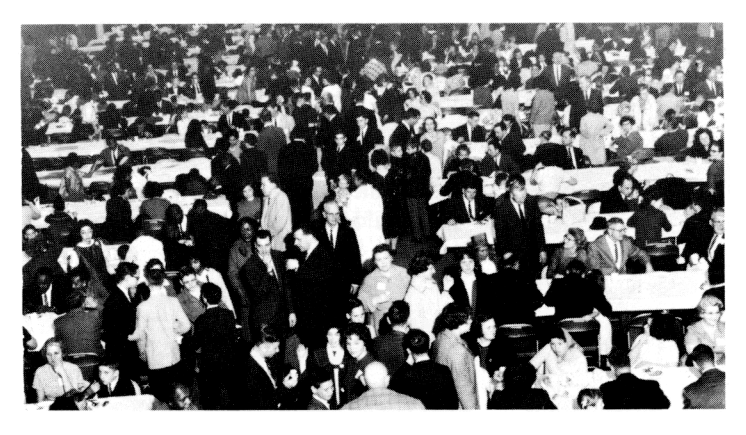
This is the Armory in Gary which served as one of the four eating places on the Night to be Much Remembered. Food was served to a capacity crowd, over 1,000.