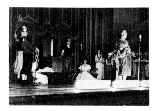
It's a puzzlement.