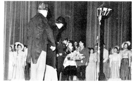
My Fair Lady.