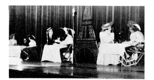
I remember it well.